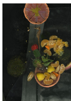
10. Cassidy Garbutt Untitled (Ecology of the Studio I) , 2018 archival print with pastel 44 x 32 inches