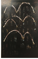
8. Mason Dowling Swift Parade , 2022 acrylic on panel 72 x 48 inches