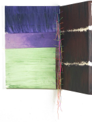
9. Maria Theresa Barbist Vernaecht IV , 2020 acrylic on canvas, twine, thread, wood, hinges 36 x 40 x 21 inches