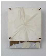
12. Mason Dowling Untitled , 2016 nails, sheer polyester, styrofoam, chipboard, glue, fabric on panel 10.5 x 8 inches