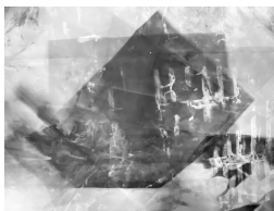
14. Cassidy Garbutt Forever - is Composed of Nows, IV , 2016 pigment print on canvas 60 x 80 inches