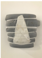
13. Mason Dowling Untitled , 2019 insulation foam, sheer polyester 10.5 x 9 inches