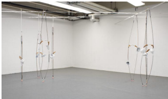
11. Tisha Benson Half the Hum , 2022 mixed media dimensions variable